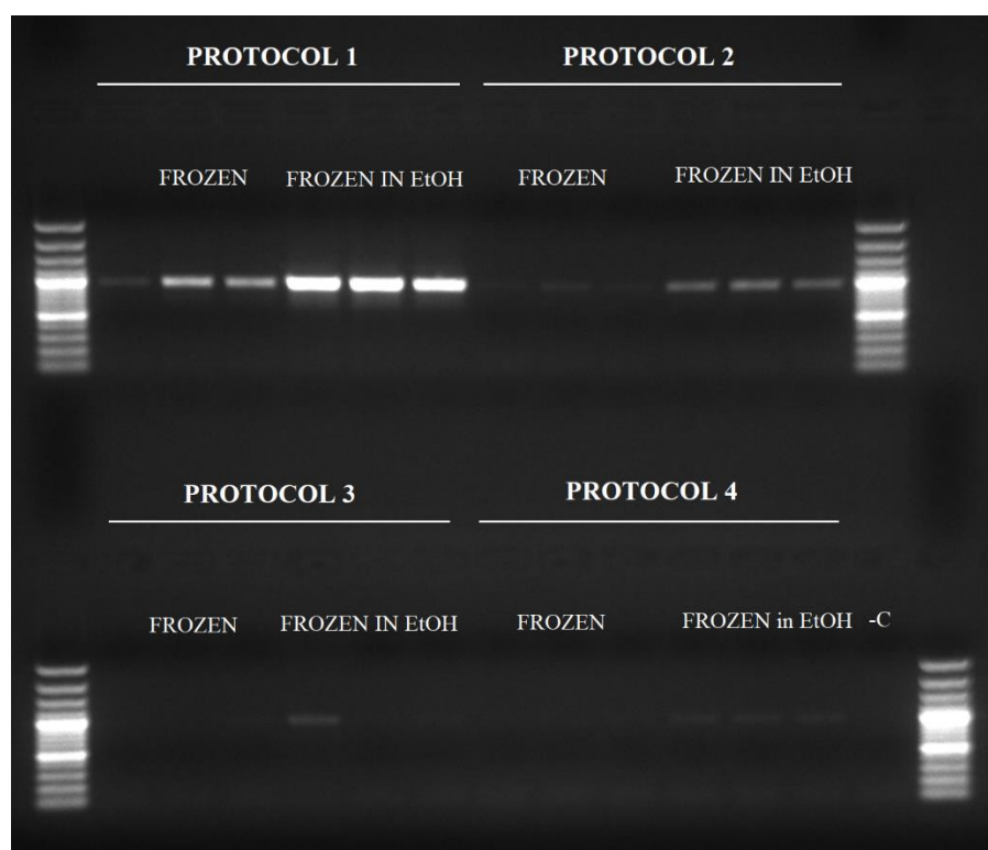
Fig. 2: Amplicons from the PCR using Ips_F_cons/Ips_R_cons after separation (100 bp ladders used)

PCR using primers Ips_F_cons/Ips_R_cons were more successful, as most of the protocols we tested produced amplicons of expected size around 936 bp (Fig. 2). However, only amplicons produced using protocols P1 and P2 were of sufficient quantity and quality to enable successful sequencing (Table 5).